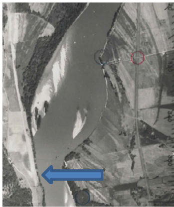
SANDBAR IN 1953