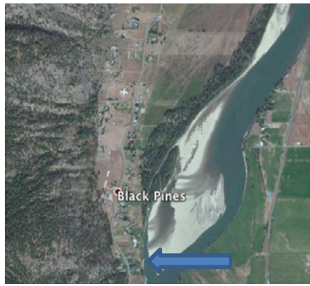
SANDBAR IN 2011

A review of aerial photos over a 60-year period shows that the sandbar is migrating southward and threatens to engulf the intake location and cut off water supply for the community. The sandbar situation also creates water quality problems when river flows are low. The arrow indicates where the current intake is located.