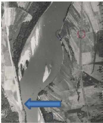
SANDBAR IN 1953