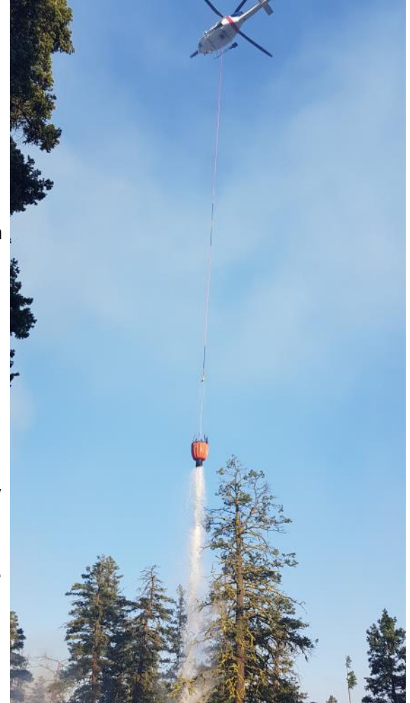
Bucketing on the Elephant Hill Fire

Please note that this is an active fire and the situation can change quickly. Information on the BC Wildfire Service Wildfire of Notes website is updated as often as possible. Information regarding evacuation orders and alerts is available at: tnrd.ca and cariboord.bc.ca