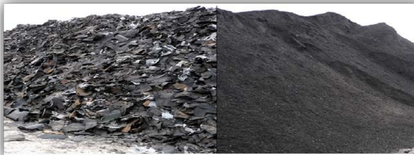
Asphalt shingles before & after processing. Intercity Recycle processes shingles from TNRD facilities.

The TNRD must pay processing and transportation fees for recycling asphalt shingles, concrete & asphalt and wood waste. A portion of these costs are recovered through user fees when material is dropped off.